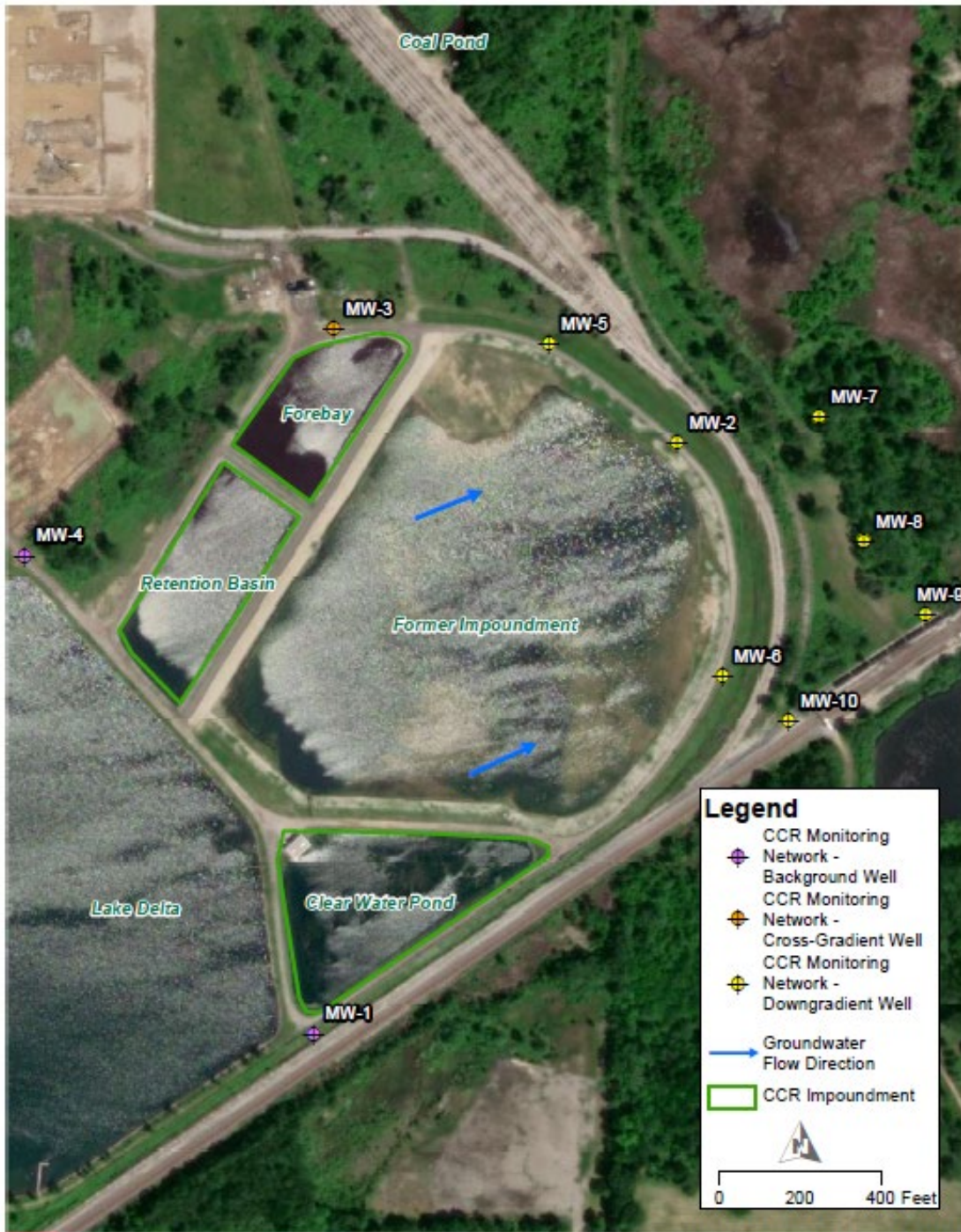
ERICKSON POWER STATION EATON COUNTY, MI