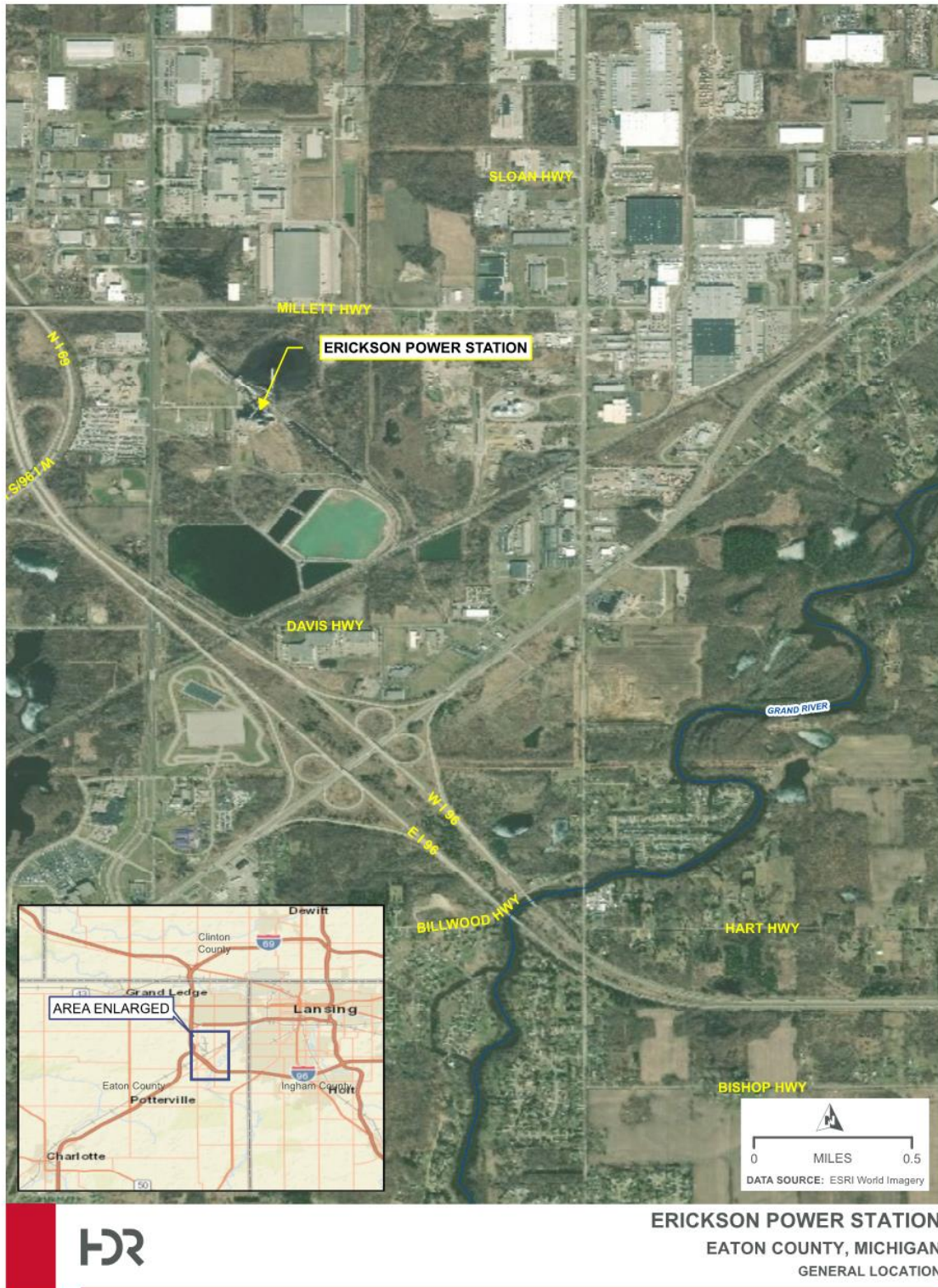
Figure 1. Vicinity Map for Erickson Power Station